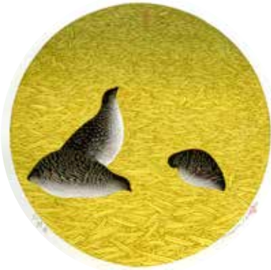
Left: 'Autumn Outing', water-based woodcut, Yu Chengyou.