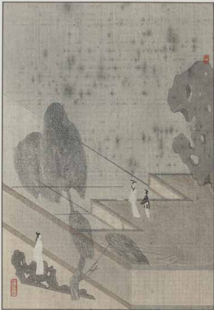
Left: 'Smoky Willow of a Garden No. 6', douban multiple woodblock, Wang Chao