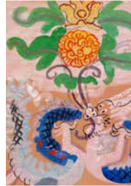
Far Left: 'Year of the Tiger', 1986, gouache on paper, Bùi Xuân Phái'.