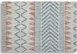
ANUSI (6 colourways)