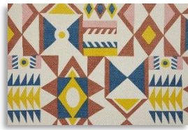
KASMA (7 colourways)