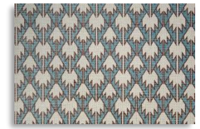
PUMORI (6 colourways)