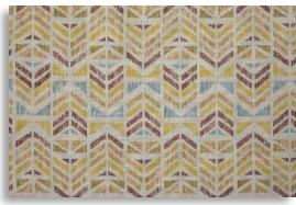
BRAKKA (4 colourways)