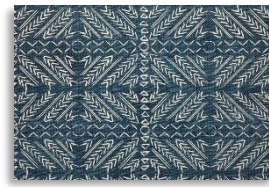
NIKAL (10 colourways)