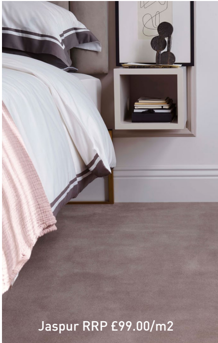
Jaspur RRP £99.00/m 2

Jacaranda's new Jaspur and Jaisalmer pure wool designs are hand-woven on traditional wooden looms, this artisan practice allows for the creation of wonderful textures. Jaisalmer is an unusual but subtle linear stripe only achievable by hand, and Jaspur is a rich smooth velvet.