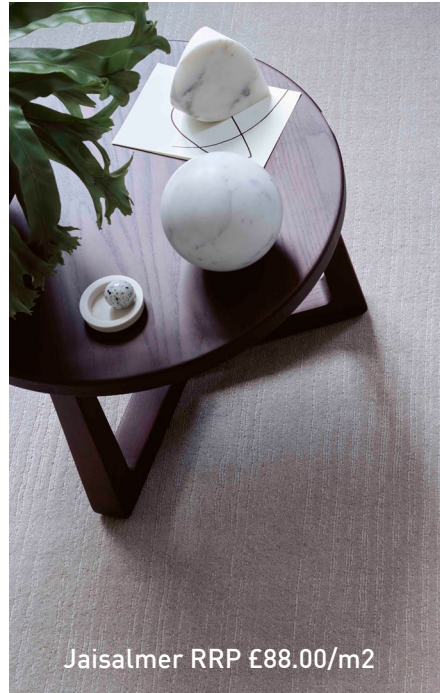
Jaisalmer RRP £88.00/m 2